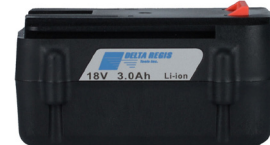
ESB-18VL3900 (sold separately)