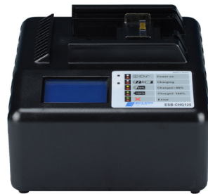
ESB-CHG120 (sold separately)