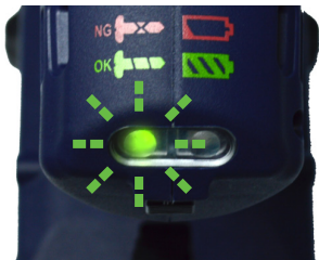
OK Rundown LED (Green)

The ESB6 Series Cordless Screwdrivers are programmed to avoid poor performance if the battery charge gets too low. When the available battery power reaches 20%, the tool will continue to function and the red battery LED will flash accompanied by several short beeps. When the battery reaches 10% charge, the red battery LED will illuminate for a few seconds accompanied by several beeps. The driver will stop functioning. At this point remove and replace the discharged battery with a fully charged battery to continue production.