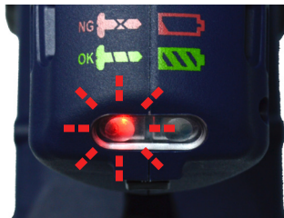
NG Rundown LED (Red)