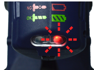
Battery LED (Red)