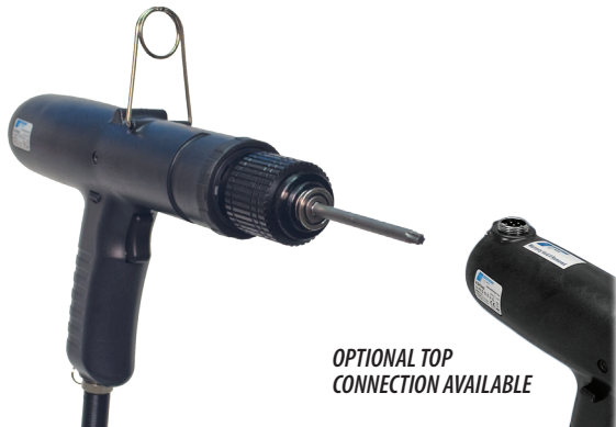
OPTIONAL TOP CONNECTION AVAILABLE

*Standard model has cable connection in bottom of handle — for top connection, add suffix 'U'. For ESD-safe housing, add suffix '-ESD'.