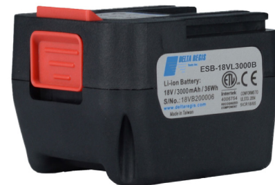
Approximate Battery Charge Times