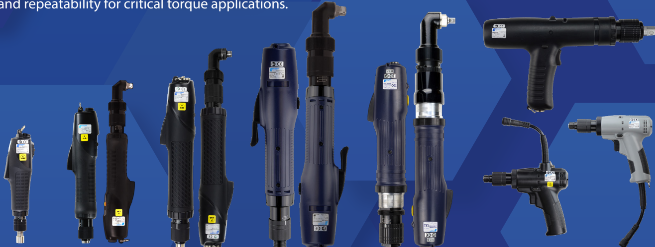
CESL810-812 32V Compact 0.02~0.98 Nm (0.2~8.7 in-lbs)

Delta Regis Tools offers the largest torque range available in the market for shut-off clutch style electric screwdrivers. Our clean and powerful brushless motors are built to the highest quality and are backed by an outstanding 3 year warranty. Our proven precision clutch technology also offers amazing accuracy and repeatability for critical torque applications.